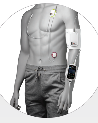
Radius VSM with SpO2, NIBP, ECG, Continuous Temperature, Acoustic Respiration Rate, and Patient Orientation, Position, and Activity Monitoring