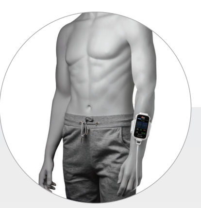
Radius VSM with SpO2